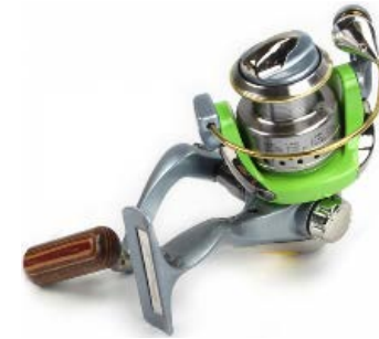
Fishing Spinning Reel.

Hooks are made of stainless steel and reels and ancillary equipment, mostly for sea fishing, are usually made of stainless steel.