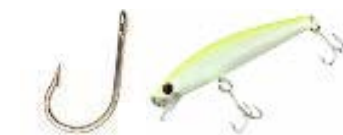
Hook and Wobler